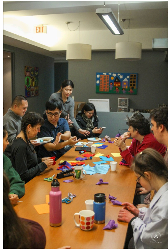
Getting creative at Advance Road and Community Junction