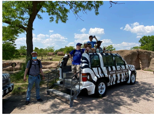
Foster Connections participants exploring at the Zoo!