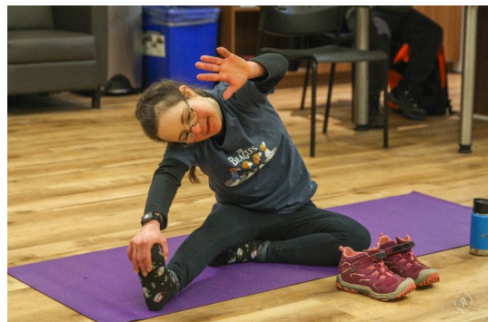
Community Junction participants in the community and stretching it out