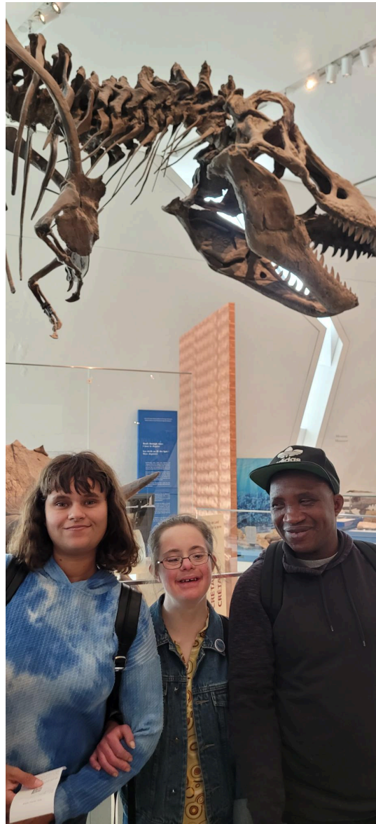
Community Junction participants enjoying the Royal Ontario Museum